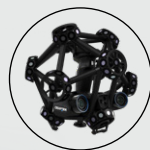
Also available for the MetraSCAN 3D