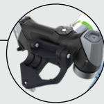
Quick release design: Switch from automated to handheld mode